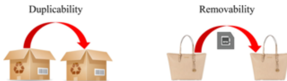
Figure 1: Some of the fraud opportunities when current barcode/RFID/3D-stamps/sensor technology is used in blockchain-enabled supply chain.

Bitcoin cannot be used in any platform other than the blockchain network. In Bitcoin, all transactions are traceable; however, this is in general not true in the supply chain.