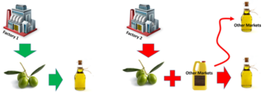
Figure 2: A fraud opportunity due to external markets not integrated into the blockchain.

It would be interesting to explore the ways that a blockchain network and other non-blockchain- based markets could interact.